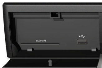
Inside Left Door