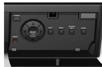
Inside Right Door